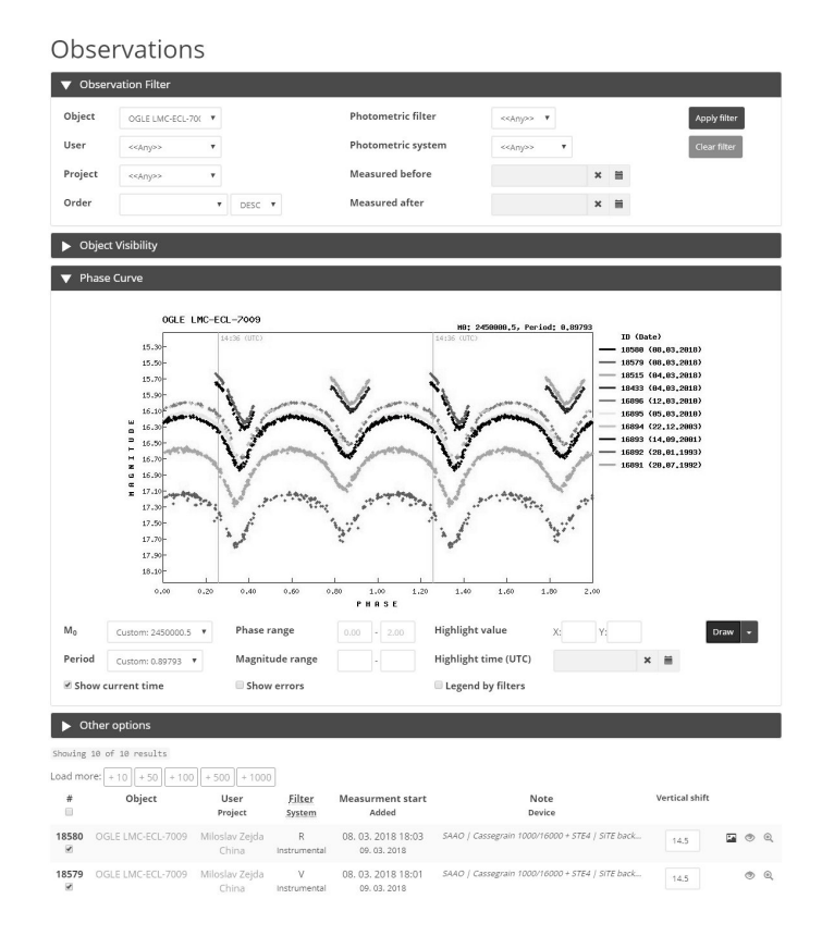
Figure 2. An example of the dataset for a star in the AMPER database.